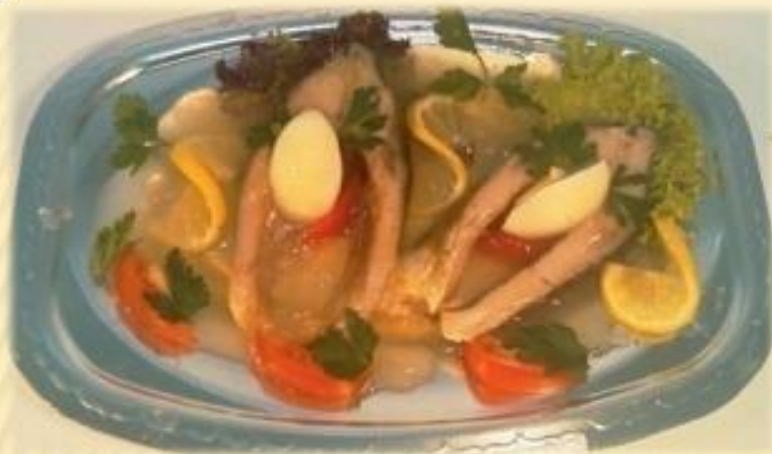
Carp in jelly