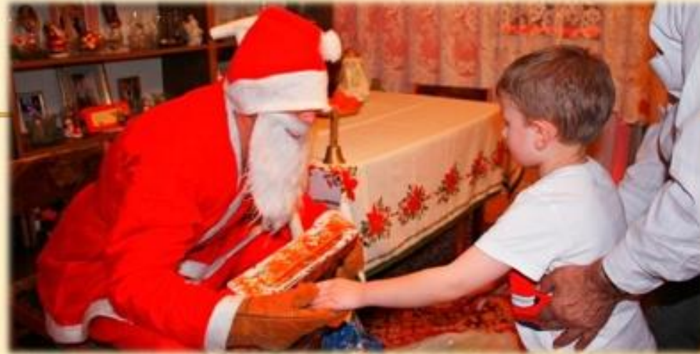
Santa is giving presents